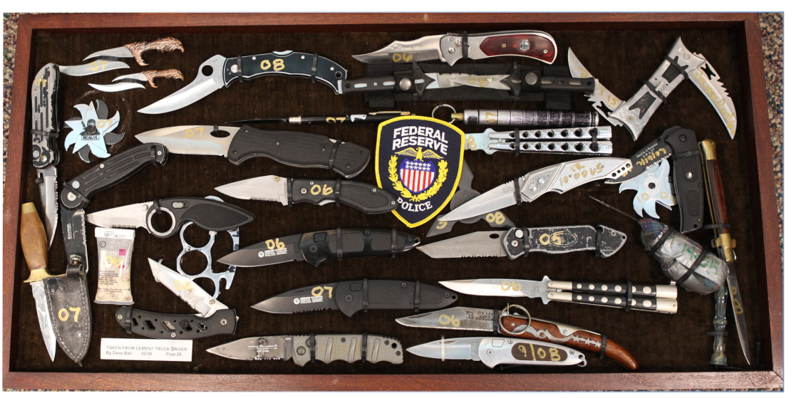
A small collection of the weapons confiscated by officers at lobby posts.

"The second ring of security is physical," Donovan continues, referring to the barriers that secure our perimeter and our own extensive surveillance system, which includes close to 200 CCTV cameras throughout and around our facility. "And lastly, what people are most familiar with is the core of our approach - the pedestrian screening that takes