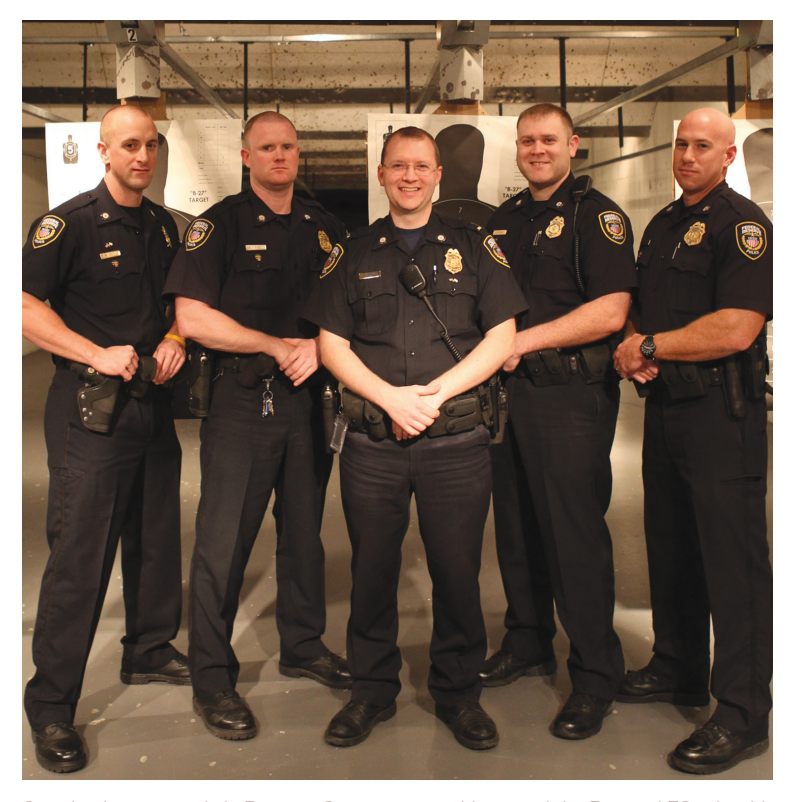
Our pistol team excels in Reserve System competitions, and the Boston LEOs vie with each other in the annual Holiday Rifle Competition, with 25-30 shooters each year. Five of the six team members are shown here on the firing range.

There are approximately 70 law enforcement personnel across three shifts, including the chief of police, the deputy chief, 2 captains, 5 lieutenants, 7 sergeants, 10 cor-