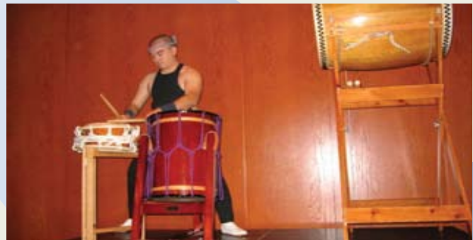
This year, the celebration featured a drummer from Odaiko New England (ONE). ONE is a performing group that weaves the traditional elements of taiko (Japanese drums) with contemporary influences to create a constantly evolving and dynamic art form.

Every December, the Consulate hosts an elegant evening reception in the Harborview Dining Room in honor of the Emperor's Birthday, a national holiday in Japan. We thought you would enjoy some pictures from their most recent event.