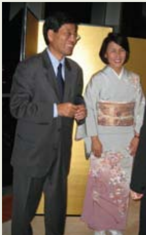
Honored guests at the Emperor's Birthday celebration are greeted by the Consul General and his wife, who is garbed in a traditional silk kimono.

Since 1993, the Consul General of Japan has made his home here at Federal Reserve Plaza. The Consulate staff of 24, including the Deputy Consul General, 5 Consuls, 3 Vice Consuls and research and operations staff have been assisting American and Japanese constituents from the New England states with everything from establishing companies in Japan, to the Japan Exchange and Teaching (JET) Program and Monbusho (Ministry of Education) scholarships, to visa applications. Their efforts support the economic, cultural and educational links between our two countries.